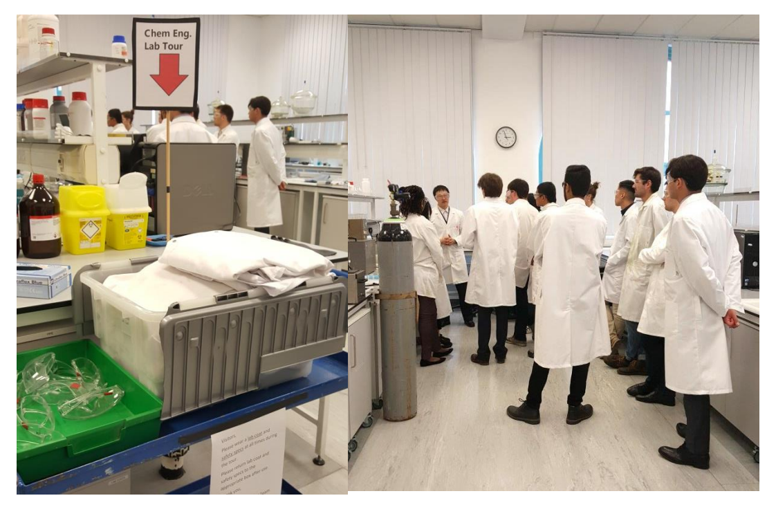
Figure 10. Guided tour to the Electrochemical and Corrosion lab of Strathclyde University. Personal protective equipment was provided to the delegates.

Following the keynote lectures, the delegates were invited to a lab tour to the Electrochemical and Corrosion facility of Strathclyde University. The organising committee members guided the visitors and showcased their research projects and equipment.