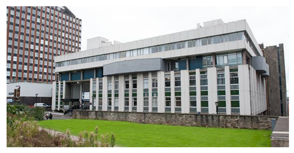
Figure 1. Event venue McCance building at Strathclyde University campus.

The conference took place at McCance Building of Strathclyde University, Lecture Theatre 301 (3<sup>rd</sup> Floor), University of Strathclyde, 16 Richmond Street, Glasgow-Scotland, G1 1XQ.